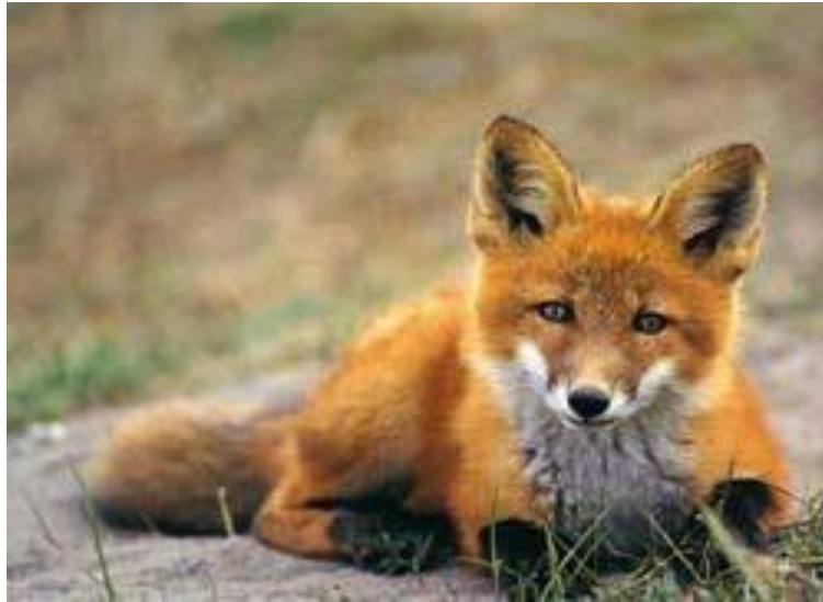
The official mascot of Marist College is the red fox.