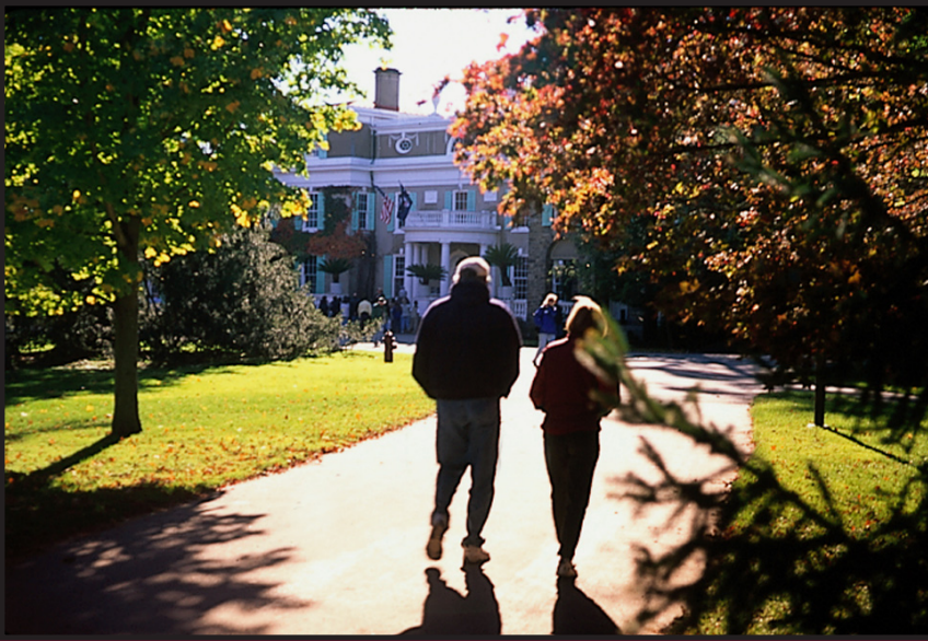
Springwood, The Franklin Delano Roosevelt home