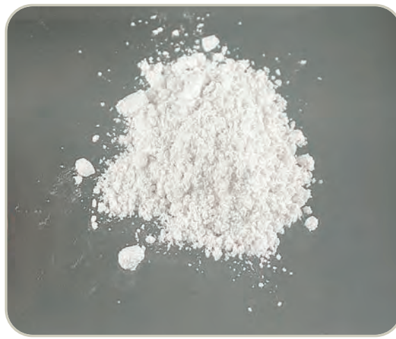
White powder heroin