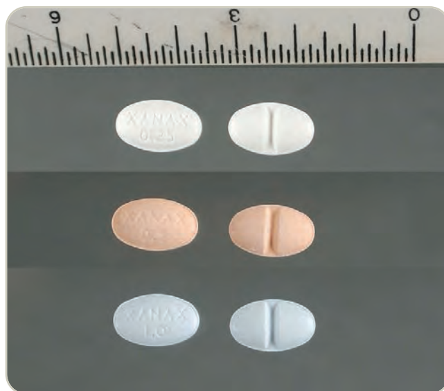
Xanax 0.25, 0.5 and 1mg scored tablets

Generally, legitimate pharmaceutical products are diverted to the illicit market. Teens can obtain depressants from the family medicine cabinet, friends, family members, the Internet, doctors, and hospitals.