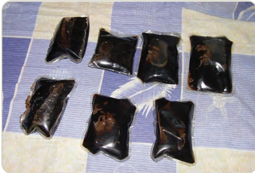
Heroin liquid packets'