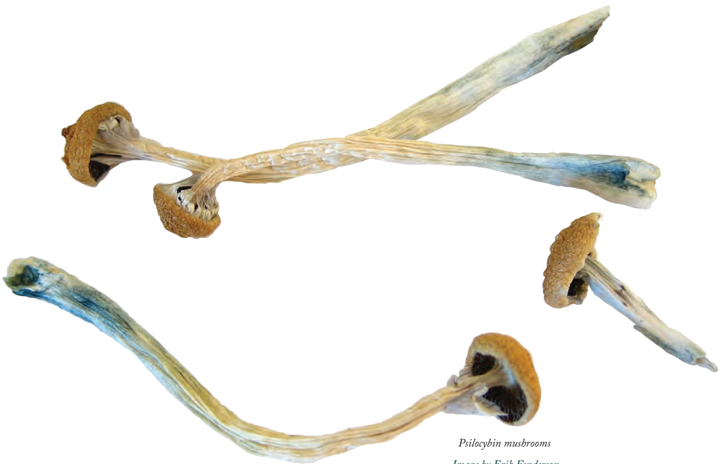
Psilocybin mushrooms

Psilocybin is a Schedule I substance under the Controlled Substances Act, meaning that it has a high potential for abuse, no currently accepted medical use in treatment in the United States, and a lack of accepted safety for use under medical supervision.