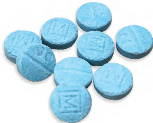
Clandestinely produced counterfeit oxycodone tablets that contain fentanyl.

Abuse of clandestinely produced synthetic opioids parallels that of heroin and prescription opioid analgesics. Many of these illicitly produced synthetic opioids are more potent than morphine and heroin and thus have the potential to result in a fatal overdose.