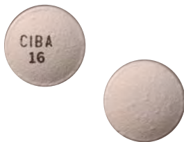
Ritalin SR 20mg tablet

Stimulants are diverted from legitimate channels and clandestinely manufactured exclusively for the illicit market.