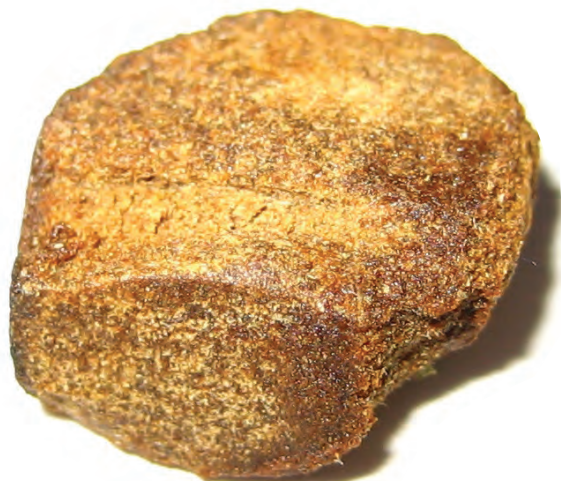
Marijuana concentrate

Marijuana concentrates can be mixed with various food or drink products to be consumed orally; however, smoking remains the most popular route of administration by use of water or oil pipes. A disturbing aspect of this emerging threat is the inhalation of concentrates via electronic cigarettes (also known as e-cigarettes) or vaporizers. Many marijuana concentrate users prefer the e-cigarette/vaporizer because it is smokeless, sometimes odorless, and easy to hide or conceal. The user takes a small amount of marijuana concentrate, referred to as a “dab,” then heats the substance using the e-cigarette/vaporizer producing vapors that ensures an instant “high” effect upon the user. Using an e-cigarette/vaporizer to inhale marijuana concentrates is commonly referred to as “dabbing” or “vaping.”