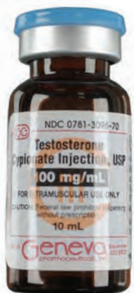
Testosterone Cypionate Injection, USP