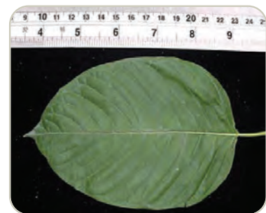
Leaf of kratom tree