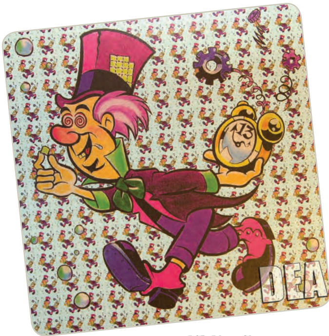
LSD Blotter Sheet