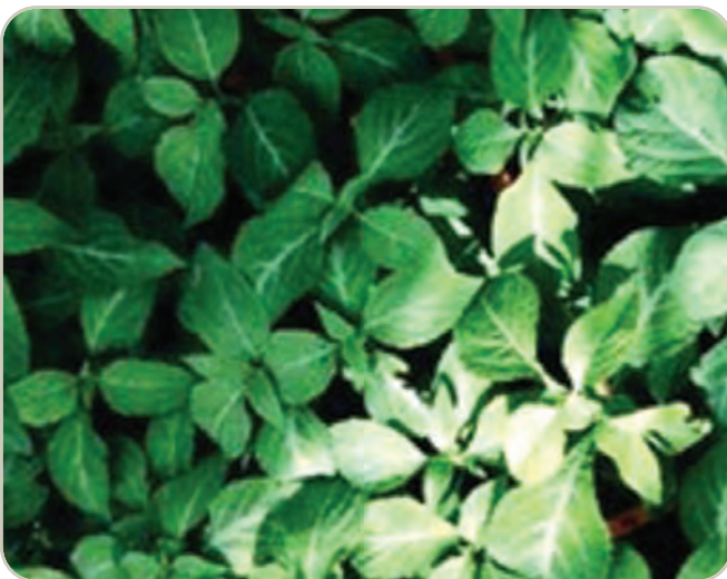
Leaves of the Salvia divinorum plant

The plant has spade-shaped variegated green leaves that look similar to mint. The plants themselves grow to more than three feet high, have large green leaves, hollow square stems, and white flowers with purple calyces.