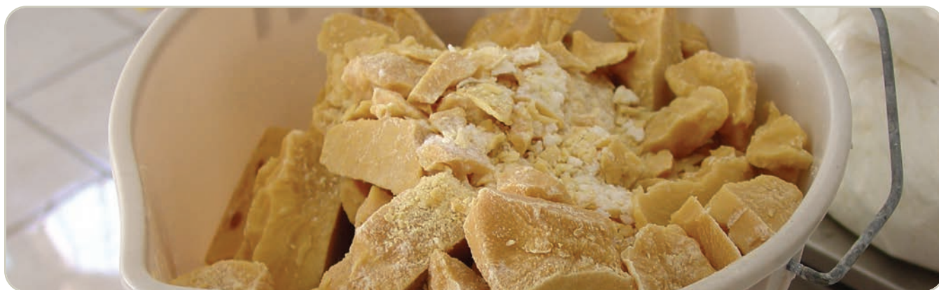
Methamphetamine in finished form

Methamphetamine is a Schedule II stimulant under the Controlled Substances Act, which means that it has a high potential for abuse and a currently accepted medical use (in FDA-approved products). It is available only through a prescription that cannot be refilled. Today there is only one legal meth product, Desoxyn®. It is currently marketed in 5, 10, and 15-milligram tablets (immediate release and extended release formulations) and has very limited use in the treatment of obesity and attention deficit hyperactivity disorder (ADHD).