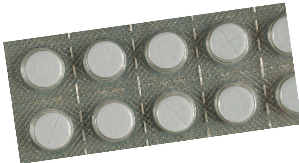
Blister pack of Rohypnol® tablets

Rohypnol® is a Schedule IV substance under the Controlled Substances Act. Rohypnol® is not approved for manufacture, sale, use, or importation to the United States. However, it is legally manufactured and marketed in other countries. Penalties for possession, trafficking, and distribution involving one gram or more are the same as those of a Schedule I drug.