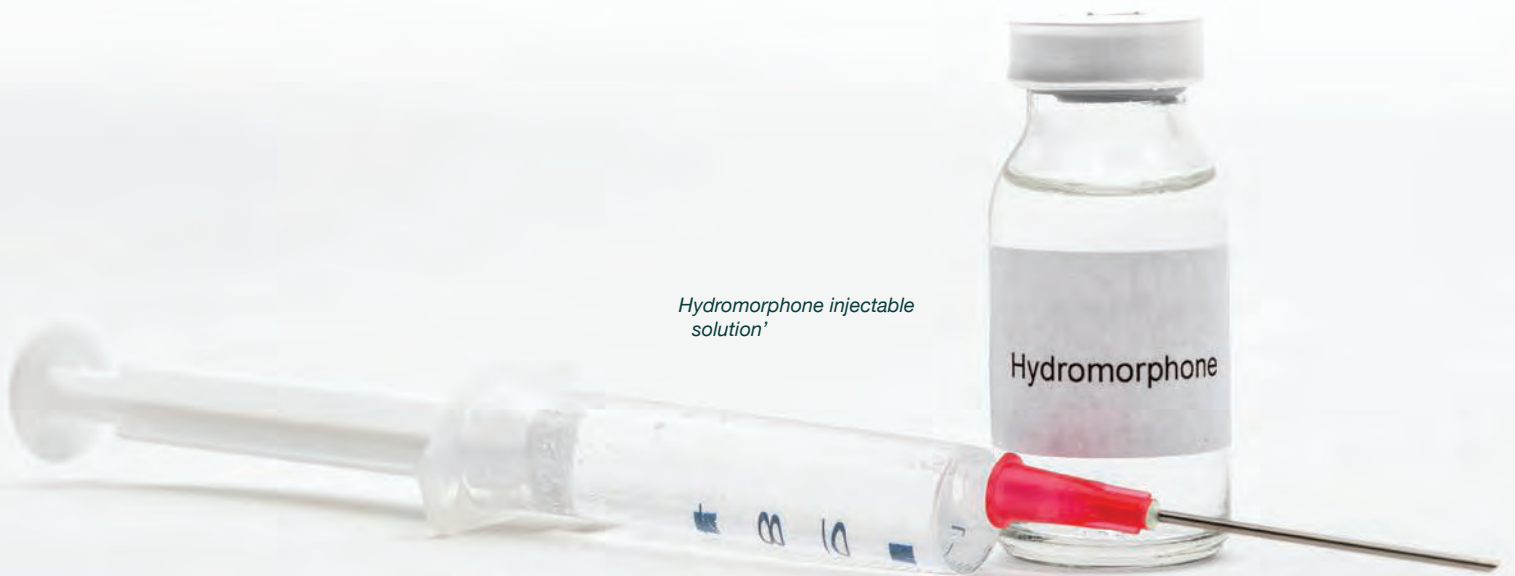
Hydromorphone injectable solution'