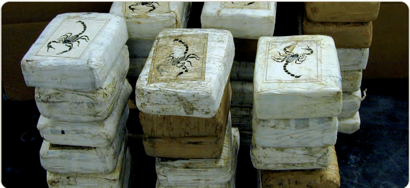
Cocaine bricks, seized by DEA

What is its legal status in the United States? Cocaine is a Schedule II drug under the Controlled Substances Act, meaning it has a high potential for abuse and has an accepted medical use for treatment in the United States. Cocaine hydrochloride solution (4 percent and 10 percent) is used primarily as a topical local anesthetic for the upper respiratory tract. It also is used to reduce bleeding of the mucous membranes in the mouth, throat, and nasal cavities. However, more effective products have been developed for these purposes, and cocaine is now rarely used medically in the United States.