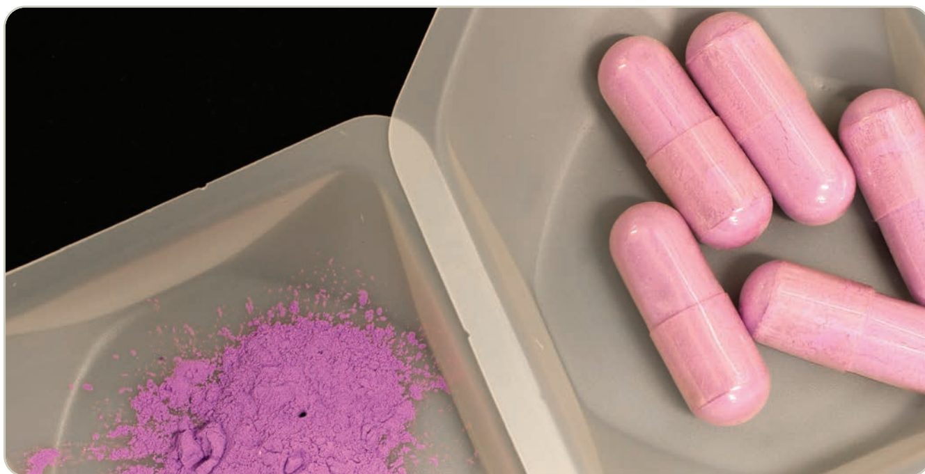
LSD powder and capsules

Many hallucinogens are Schedule I under the Controlled Substances Act, meaning that they have a high potential for abuse, no currently accepted medical use in treatment in the United States, and a lack of accepted safety for use under medical supervision.