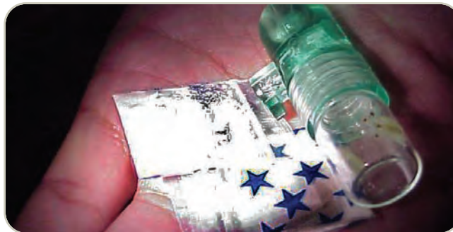
Ketamine in various forms