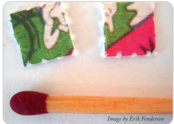
LSD blotter paper with match for size comparison

During the first hour after ingestion, users may experience visual changes with extreme changes in mood. While hallucinating, the user may suffer impaired depth and time perception accompanied by distorted perception of the shape and size of objects, movements, colors, sound, touch, and the user’s own body image.