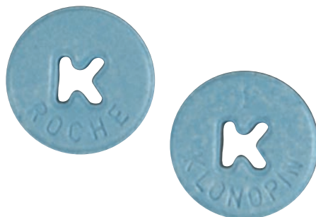
Klonopin 5mg tablet

Most depressants are controlled substances that range from Schedule I to Schedule IV under the Controlled Substances Act, depending on their risk for abuse and whether they currently have an accepted medical use. Many of the depressants have FDA-approved medical uses. Rohypnol® and Quaaludes® are not manufactured, legally marketed, and have no accepted medical use in the United States.