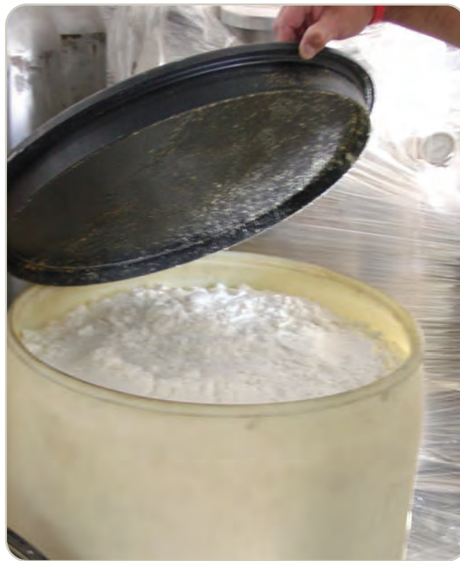
Methamphetamine in finished form

Regular meth is a pill or powder. Crystal meth resembles glass fragments or shiny blue-white “rocks” of various sizes.