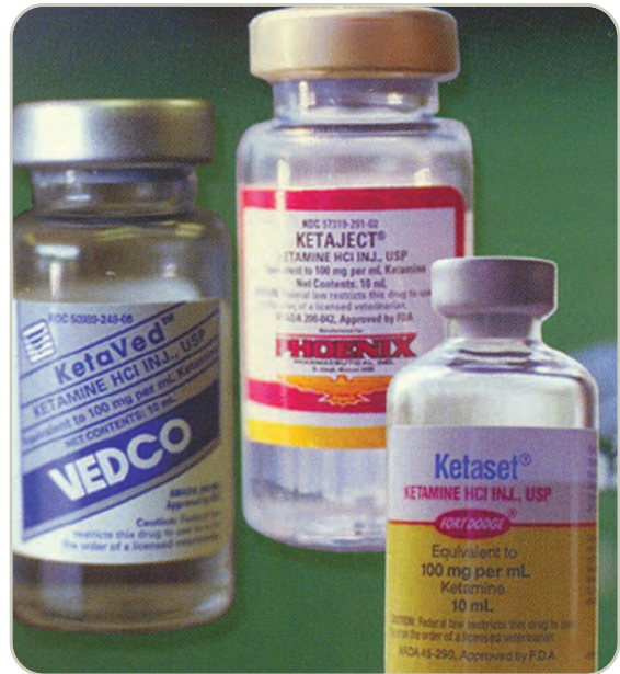
Vials containing liquid ketamine

Ketamine, along with the other “club drugs,” has become popular among teens and young adults at dance clubs and “raves.” Ketamine is manufactured commercially as a powder or liquid. Powdered ketamine is also formed from pharmaceutical ketamine by evaporating the liquid using hot plates, warming trays, or microwave ovens, a process that