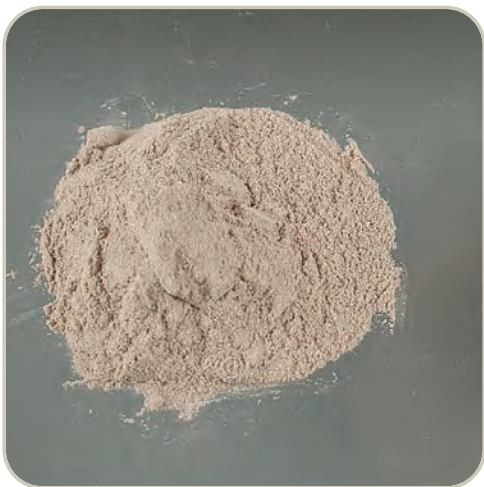
Brown powder heroin