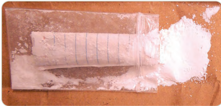
Synthetic Opioid powder U-47700.