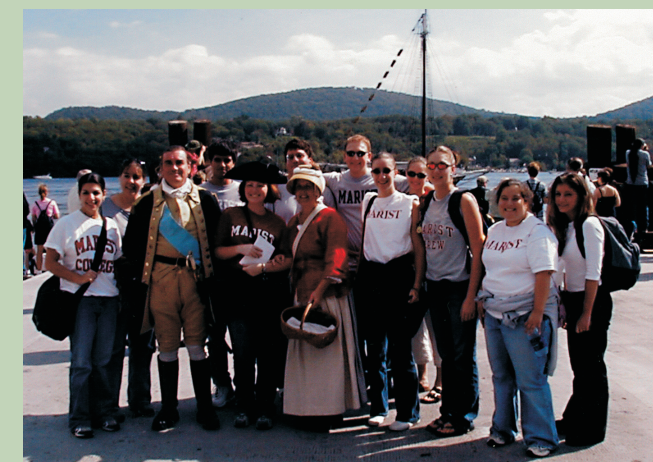
Marist interns at West Point with General George Washington

The D. J. McManus Foundation and the U.S. Department of Education grants have assisted with the funding of interns.