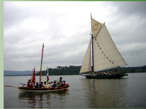
The sloop Clearwater and bateau carry troops across the Hudson

The Hudson River Valley Institute has organized and coordinated lead events for the 225th Anniversary of the American Revolution in New York State in partnership with the Hudson River Valley National Heritage Area. Each year through 2008, HRVI has promoted and will promote Patriots' Weekend, which focuses on significant historical events relating to the Revolutionary War in the Hudson River Valley 225 years ago.