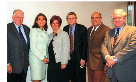
HRVI Advisory Board