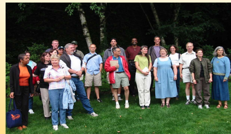
Teachers visiting Val-Kill during the 2006 summer institute

The Teachers' Institutes have been made possible by two grants of almost $2 million from the U.S. Department of Education. Additional funding is provided by the Hudson River Valley National Heritage Area, the National Park Service and the Reese Charitable Lead Trust.