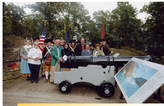
At left: Congressman Hinchey reviews troops at Washington's Headquarters. Above and below: Gov. Petaki and other officials at Ft. Montgomery, State Historic Site.