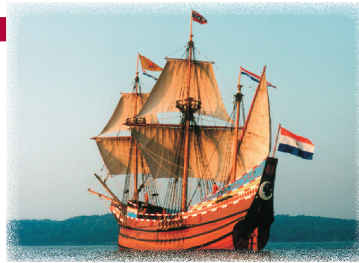
The Replica Ship The Half Moon

Issues of The Hudson River Valley Review have been underwritten by the Hudson River Valley National Heritage Area, Furthermore: a program of the J. M. Kaplan Fund, C.H. Energy Group, Inc., U.S. Cavalry Security Group, Sotheby's, Brinckerhoff-Neuville, Inc. and the Poughkeepsie Grand Hotel.