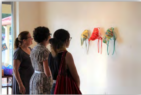
Here & There Exhibit