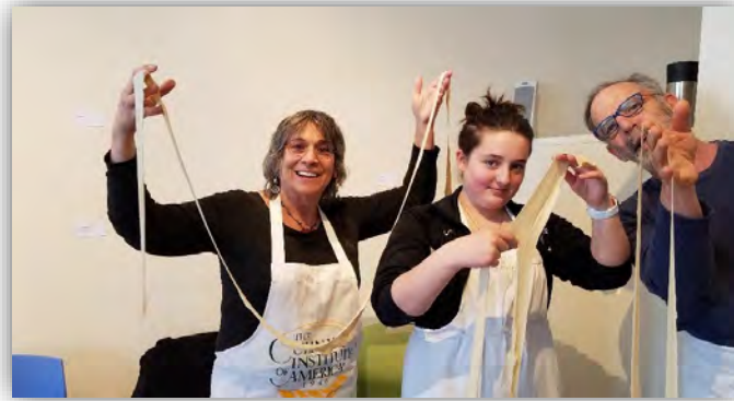
Hand Pulled Noodle Workshop