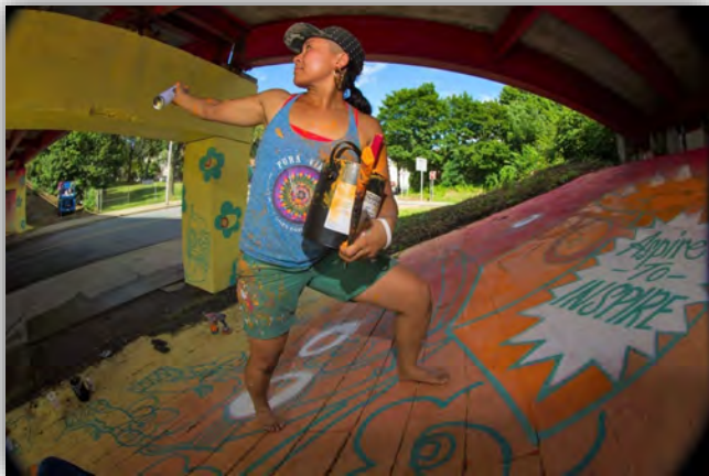
Poughkeepsie Gateway Mural Project

To provide vision and leadership to support thriving and diverse arts in the Mid-Hudson Valley