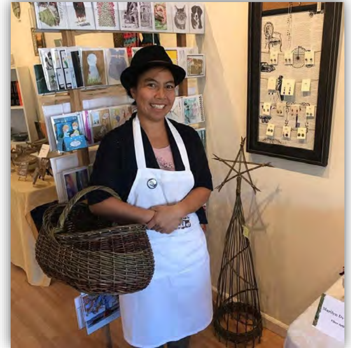
Dutchess Handmade Pop Up Shop