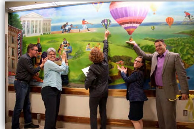
Poughkeepsie Galleria Mural Project