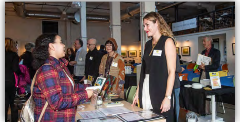
2019 THRIVE: Making a Career in the Arts