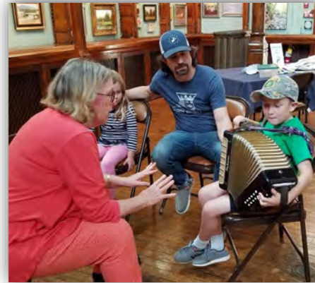
Musical Round Robin